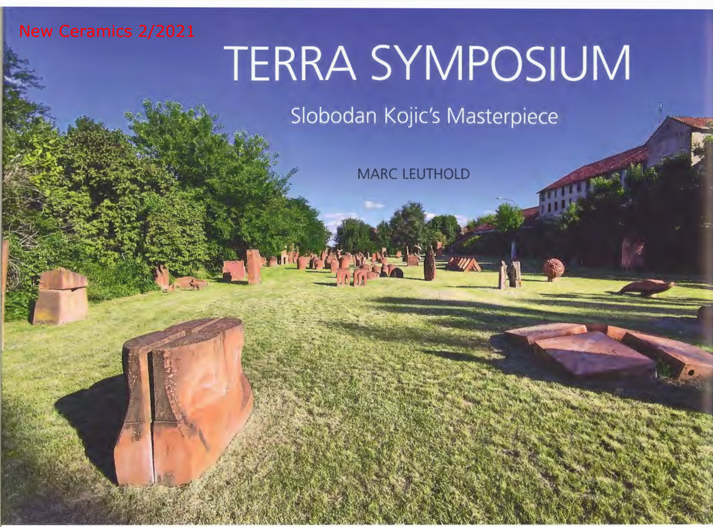
Sculpture Garden at Terra Studio